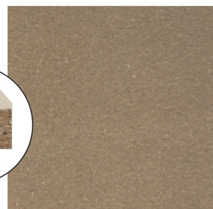
Bare High Density Particle Board Finish 598mm 2

The panel is fully tested to the BSEN12825:2001 1/A/3/2 specification and is fully compliant. The Permaflor B30598 panels have a 3 times working load safety factor and a 5 year warranty.