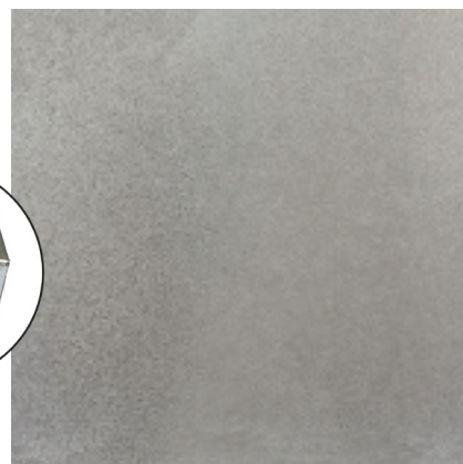
Galvanised Steel Top Lid and Bottom Tray