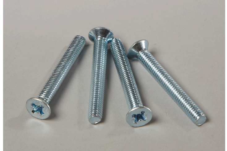
M6 x 45mm Taptite Machine Screw

The Permaflor panels require 4 of these screws per panel.